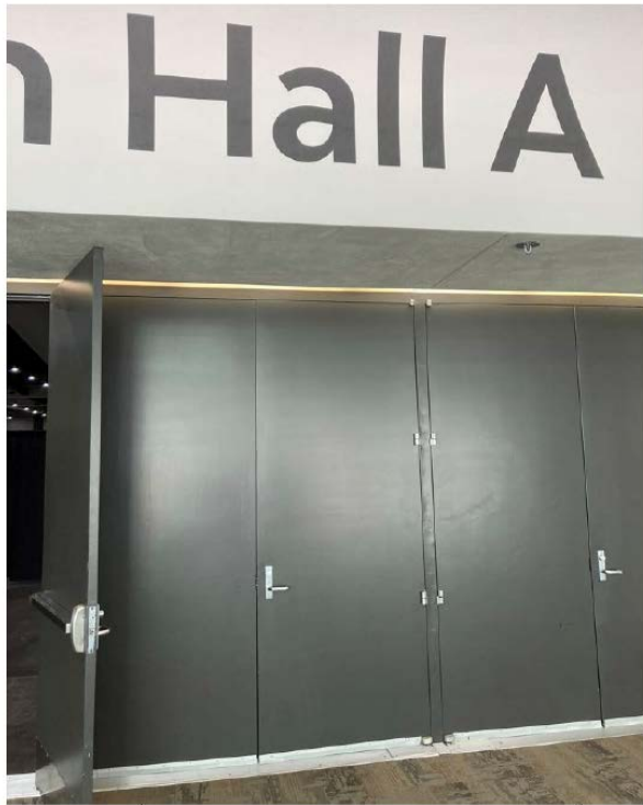
111" x 43" Exhibit Hall A Doors