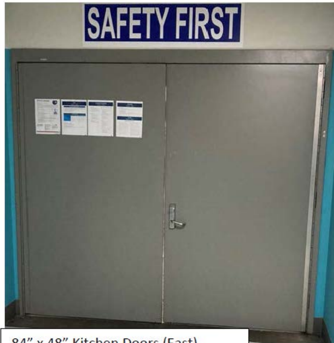
84" x 48" Kitchen Doors (East)