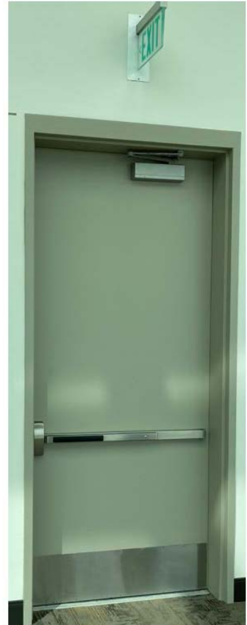
109" x 47" Exit Door (East)