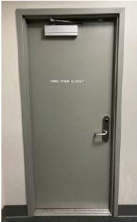
83" x 36" Finance Area