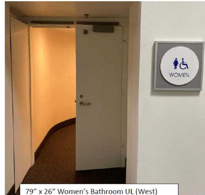
79" x 26" Women's Bathroom UL (West)