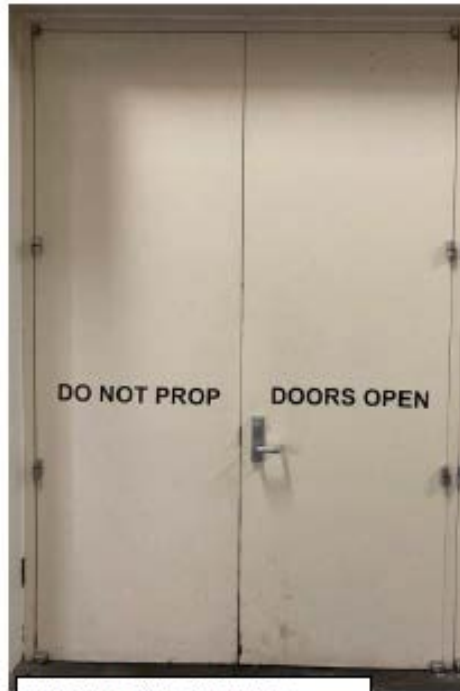
112" x 37" Hall A Exit Door