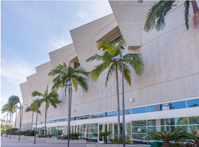
EAST FACADE 01