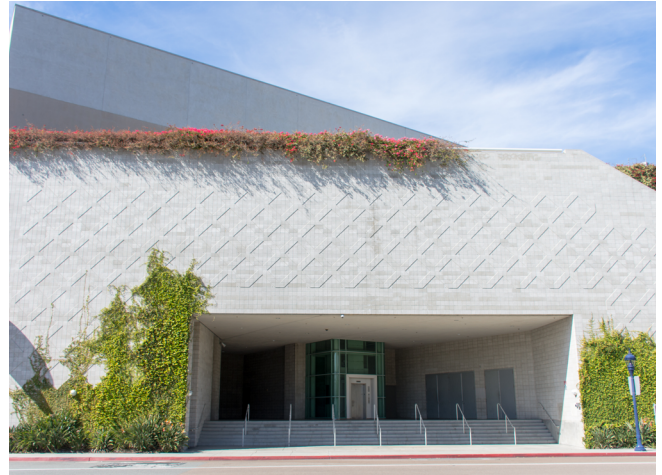
EAST FACADE 02