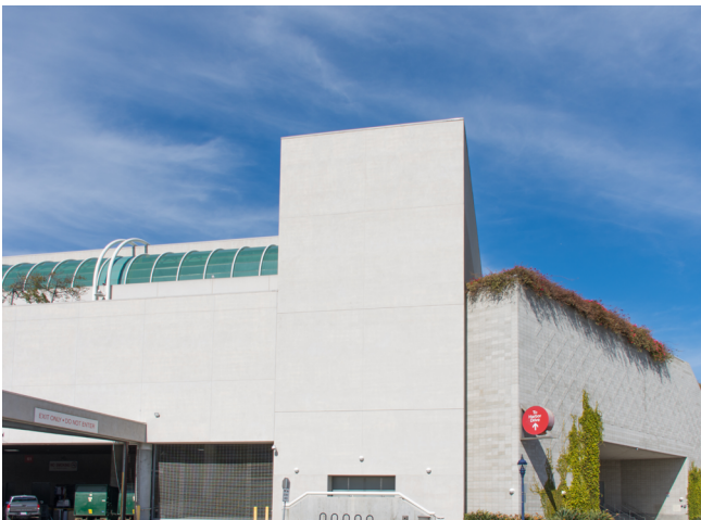
SOUTH FACADE 01