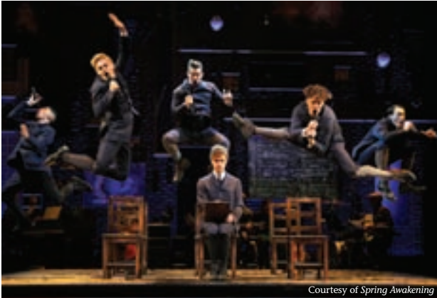
Courtesy of Spring Awakening